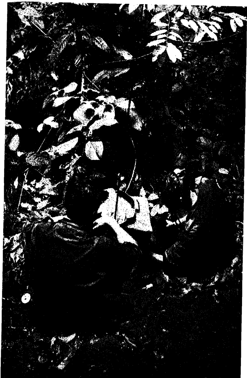
4 The struggle to get through to H.Q. on the radio