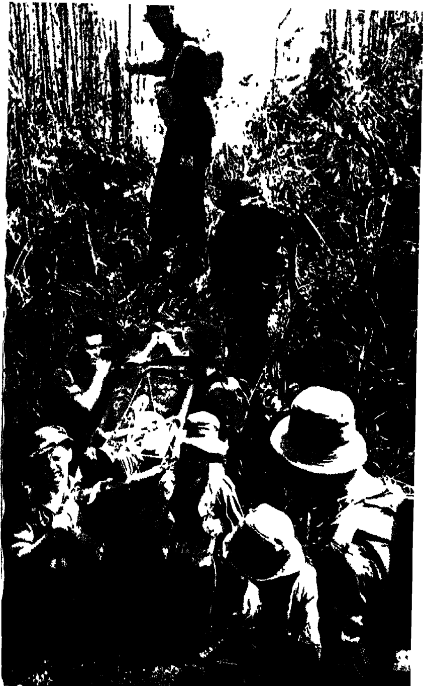
207. ... ..