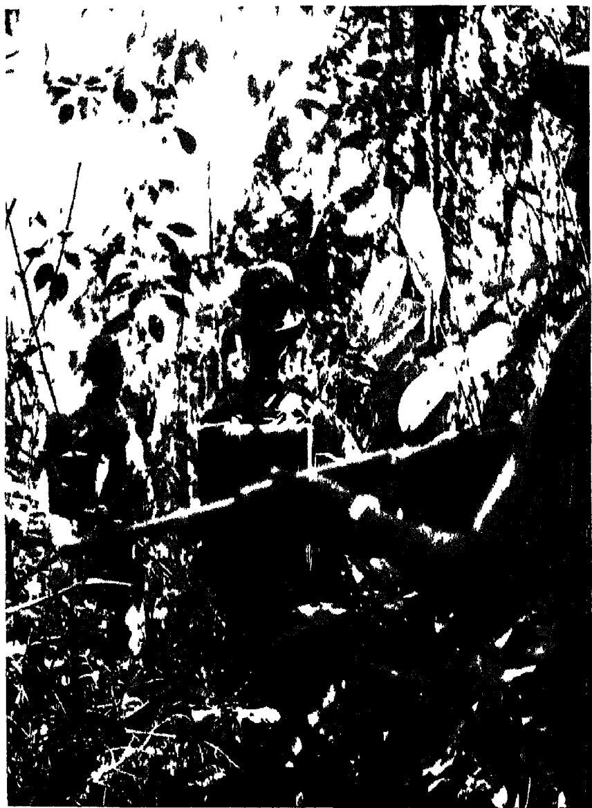
1 A pahai approaches a clearing