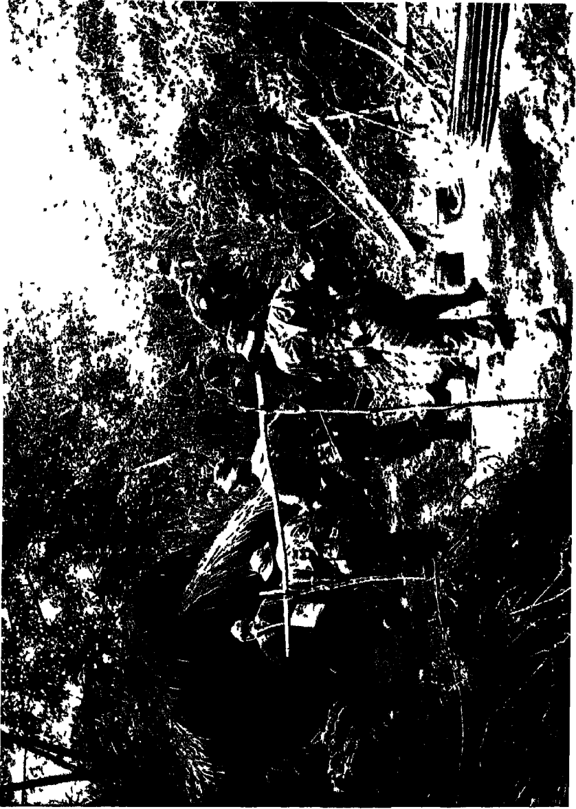
The climax, charging a bandit camp